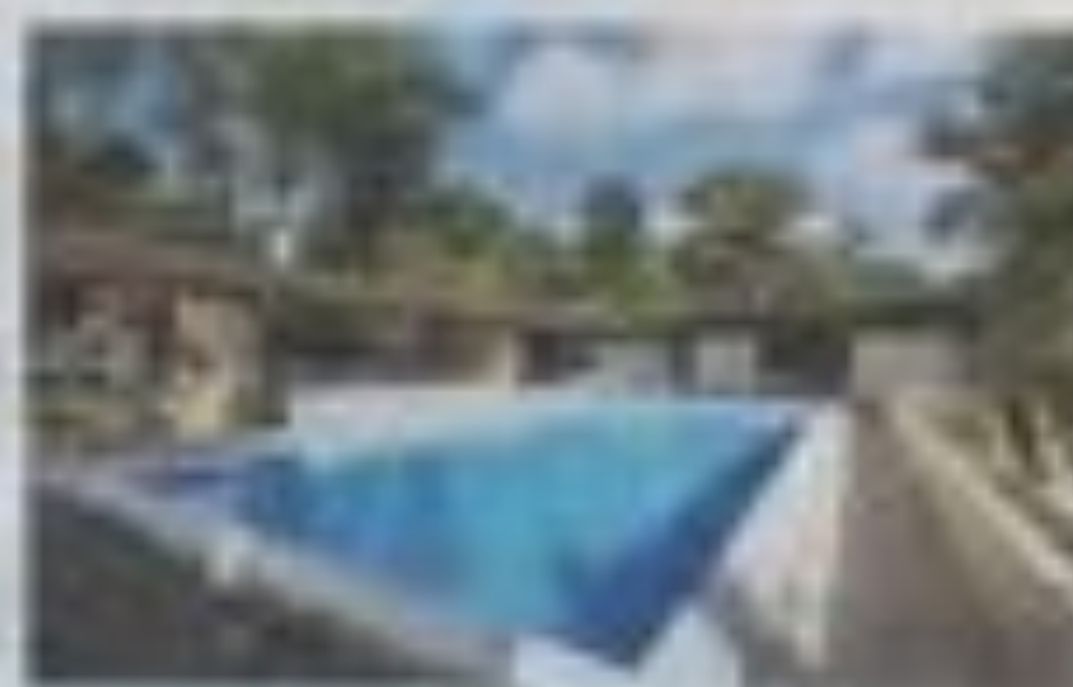
Peninsula's swimming pool is a perfect spot for relaxation and entertainment.

Peninsula is a premier waterfront community in the heart of the island, offering a lifestyle of relaxation and luxury. The community features a mix of modern architecture and traditional island charm. Residents enjoy access to a private beach, a marina with dockage, and a variety of recreational activities. The community is surrounded by lush tropical landscaping and offers a sense of privacy and exclusivity. Peninsula is the perfect place for those seeking a second home or a permanent residence in a beautiful setting.