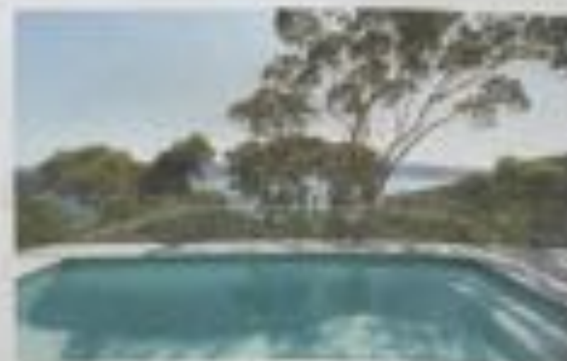
Photo top: 180 cottage on Riverview Road, Pittwater House at Casell Bay. The view from Bonye Road, Palm Beach.

Christie's International agent Ken Jacobs has the listing in conjunction with LJ Hooker Palm Beach agent Peter Robinson, with $6 million to $6.5 million expectations.